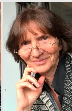
Aleida Assmann Professor University of Konstanz